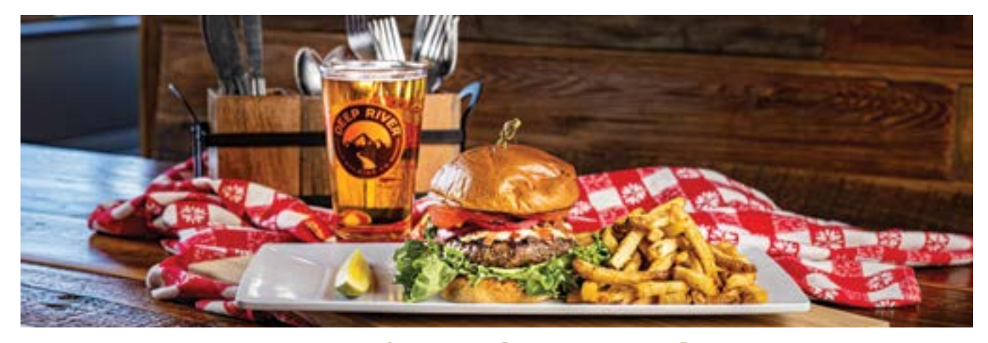
TABLE SERVICE DINING

For a taste of our dining options in Johnston County, the following list of restaurants represents a variety of flavors including Italian, Mexican, Asian and American. For a full list of restaurants in the county, visit johnstoncountync.org/restaurants .