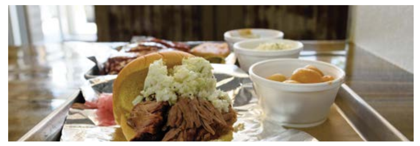
Visitors to Johnston County are fans of our barbeque, and we are too! Below find a selection of southern cooking and BBQ restaurants!