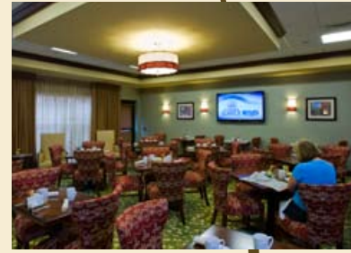
DUCKER TEA ROOM